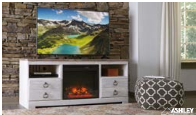
$18 99 Willowton TV Stand with Fireplace. The perfect statement piece for any living room! Whitewash finish with plank-style top and electric fireplace.