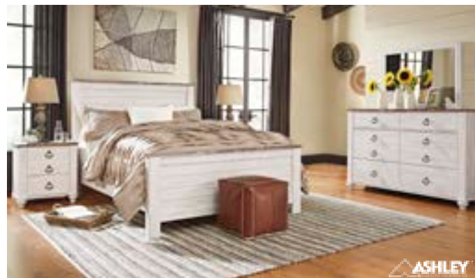
$24 99 Willowton Queen Bedroom Collection. Two-tone finish in whitewash, replicated wood with ring-pull hardware for a modern, rustic bedroom getaway.