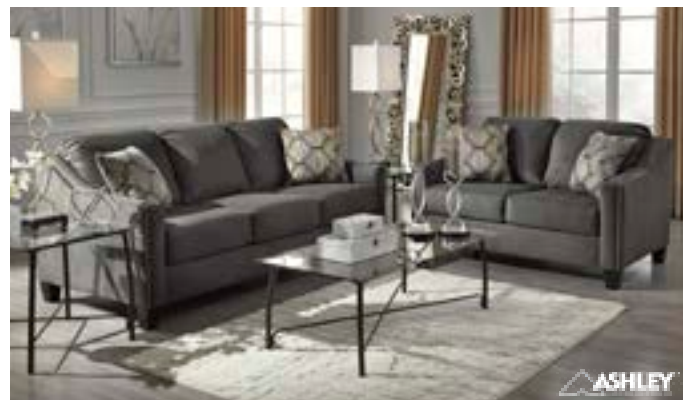
$19 99 Fezzman Sofa & Loveseat. Onyx faux leather wraps this contemporary sofa & loveseat with plush seatback cushions on a hardwood frame.