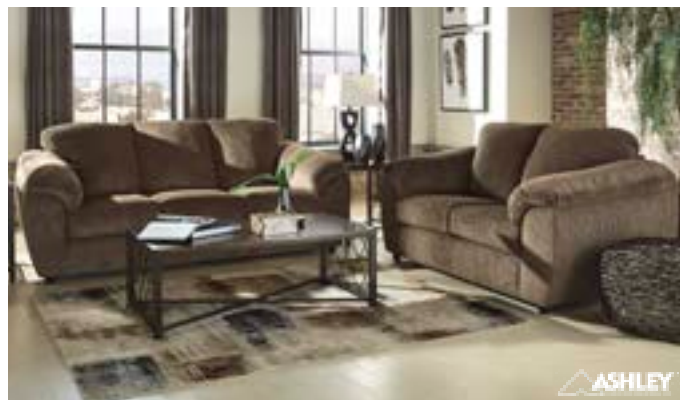
$19 99 Azaline Sofa & Loveseat. Covered in a decadently plush yet practical tan fabric with thick pillow top armrests for a cozy and chic feel.